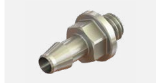
Barb to Thread