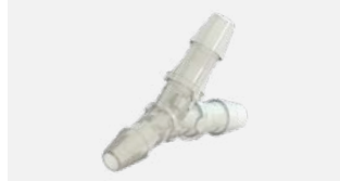
Barb to Barb