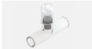
Pressure Relief Valves