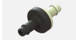
Diaphragm & Floating Disc